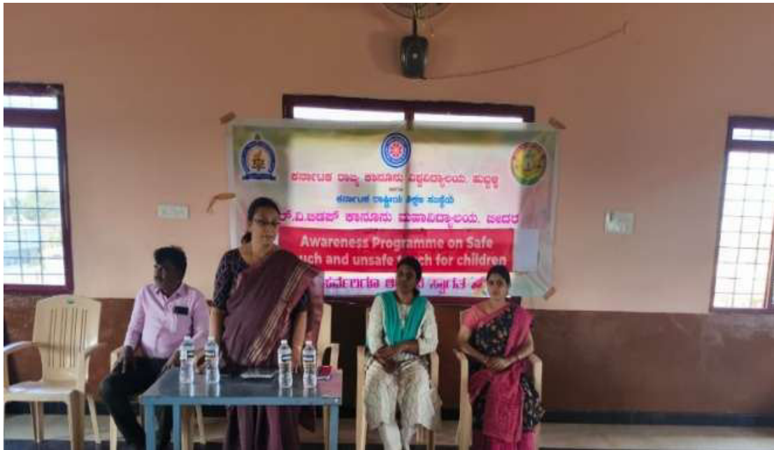
Programme on Safe Touch and Unsafe Touch for Children was organized at Basavangar Children School at Bidar on 23-08-2018 at 11.30 am.

[Signature] IQAC Co-Ordinator R.V Bidap Law College, Bidar