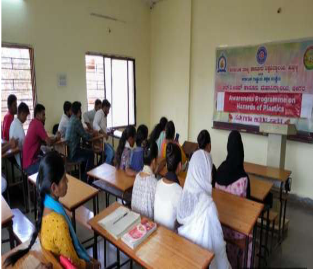
Awareness Program on Hazards of Plastics was organized for the residents of Lecture colony on 4-9-2018 at 12.30 pm in Bidar

MANHALLI ROAD, BIDAR - 585 403. ( KARNATAKA STATE) INDIA