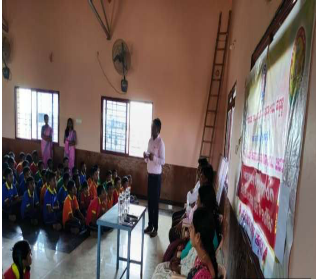
Awareness Program on Beti Bachao Beti Padhao was organized for the students of Basavanagr School on 12-1-2019 at 10.30 am

MANHALLI ROAD, BIDAR - 585 403. ( KARNATAKA STATE) INDIA