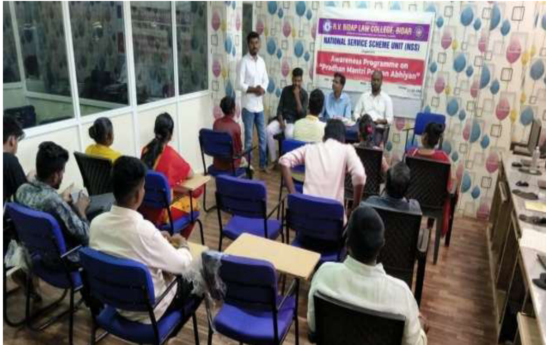
Awareness Programme on Pradhan Mantri Poshan Abhiyan for the Socially and Economically backward Residents of Mailoor Village in Bidar on 18-12-2018 at 4.30 pm

MANHALLI ROAD, BIDAR - 585 403. ( KARNATAKA STATE) INDIA